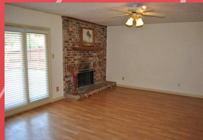
2 Large Living Areas!