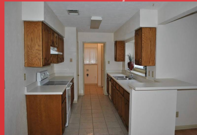
Beautiful Gallery Kitchen!